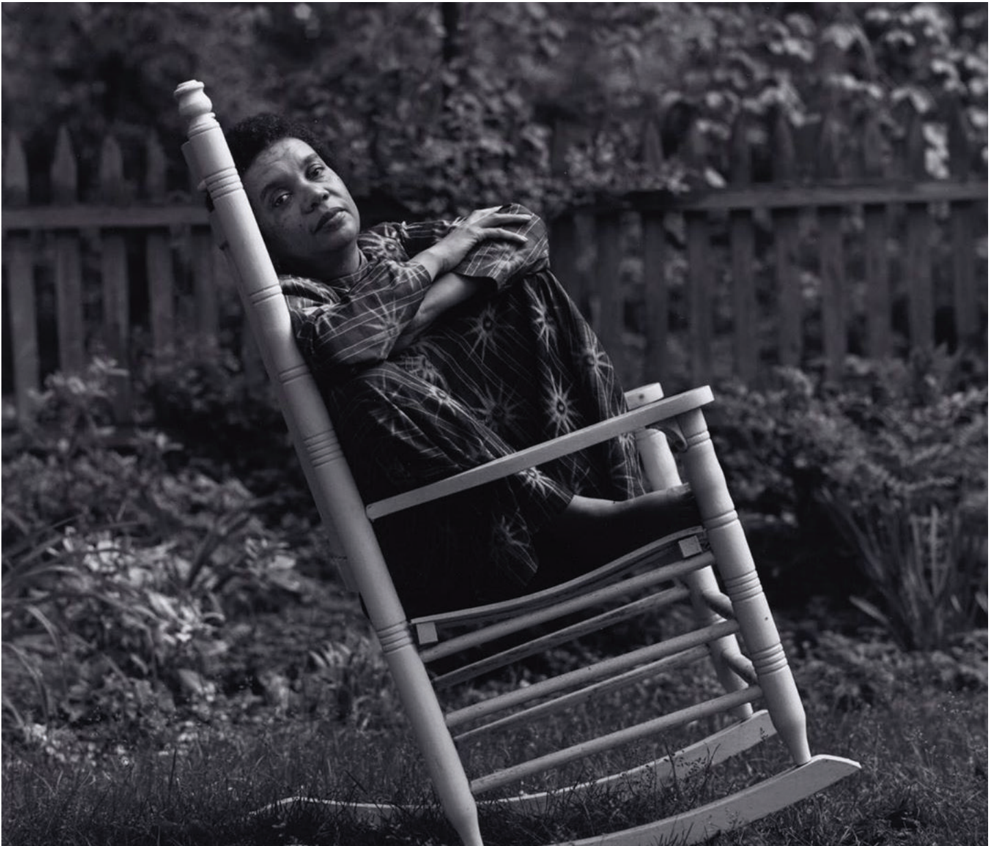
MARIAN WRIGHT EDELMAN

Marian Wright Edelman by Brian Lanker, gelatin silver print, 1989. Private Collection.