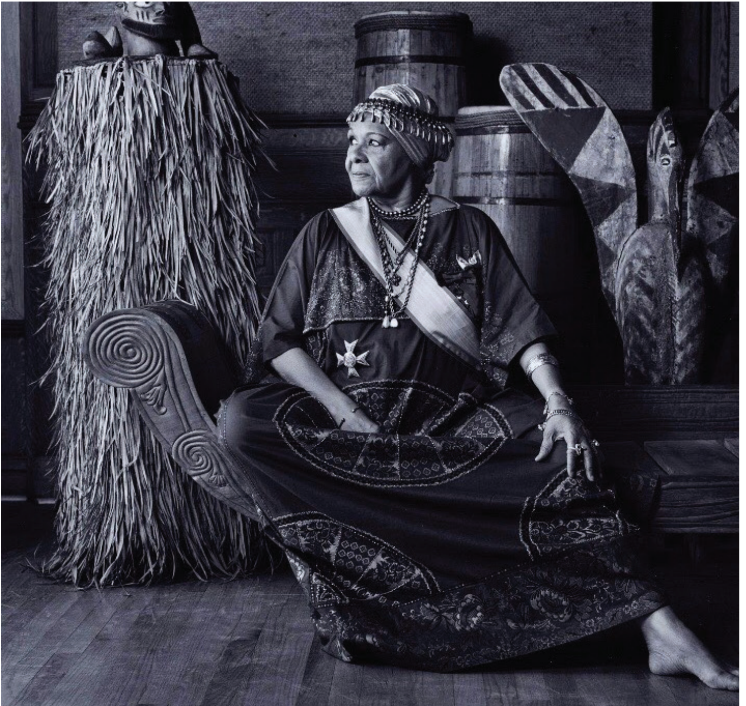
KATHERINE MARY DUNHAM

Katherine Mary Dunham by Brian Lanker, gelatin silver print, 1989. Private Collection.