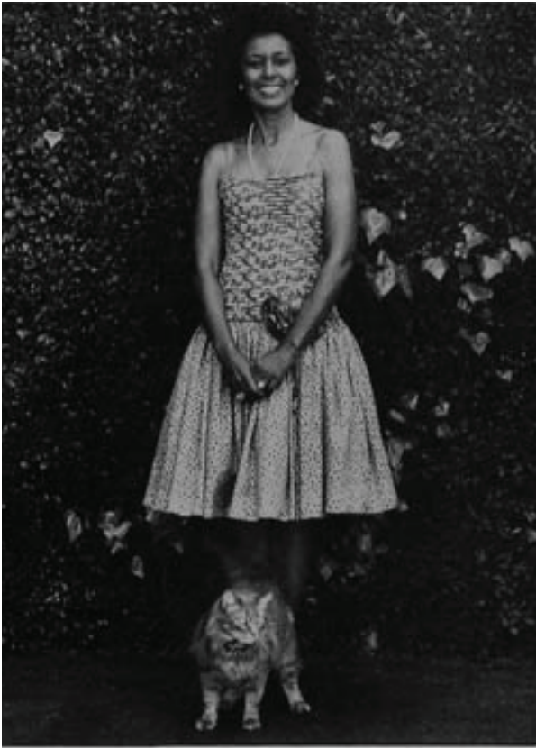
YVONNE BRAITHWAITE BURKE